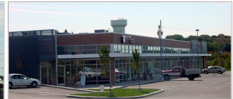
Phase II - Bays as small as 1,200 sq. ft. available